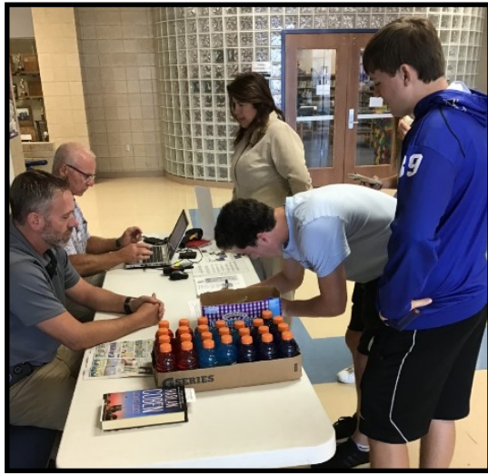
Garretson staff, students, and community members all showed up to the school on Wednesday, September 18 to donate blood when the Community Blood Bank visited Garretson schools. It was a busy, active day for the BloodMobile.