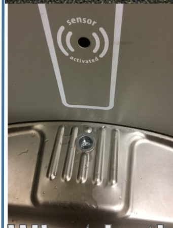
WHAT IS THIS: Water drain at the water fountains